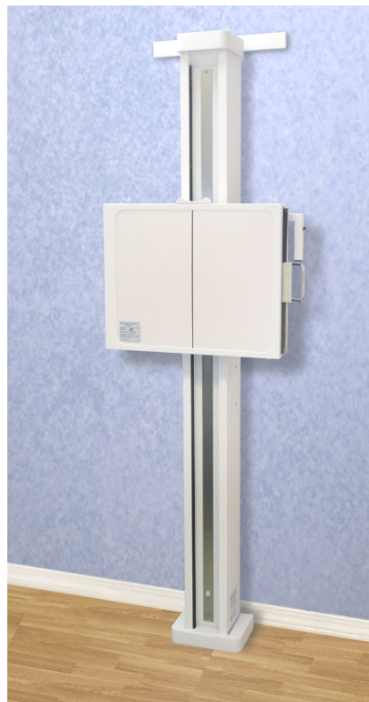
Lowers to Perform Standing Knees