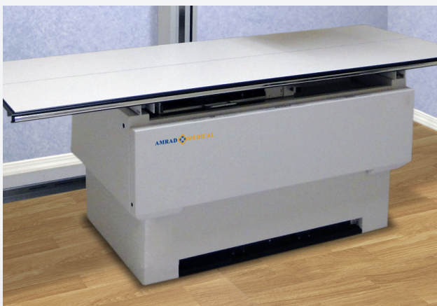
Elevating Table, 400 lb Patient Capacity