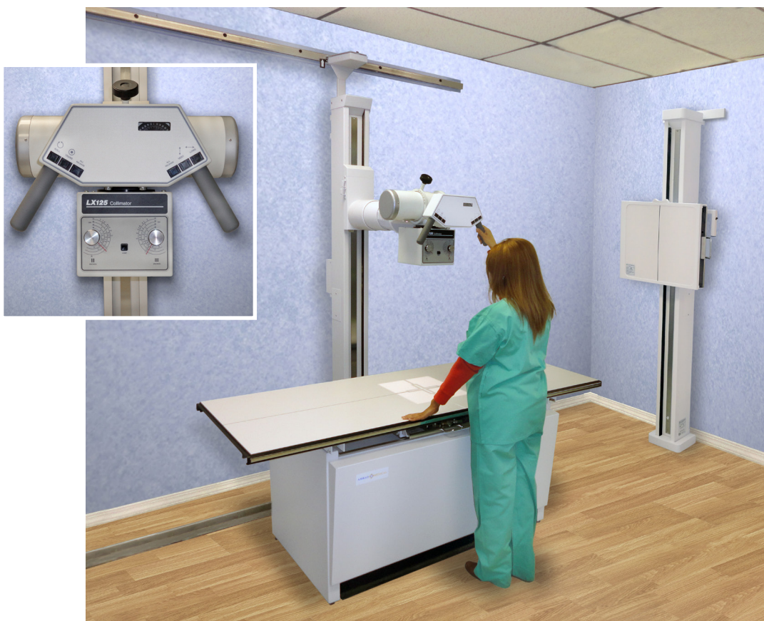
Perform all exam types to include cross table laterals