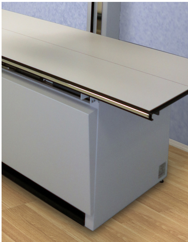
Completely Flat Table Top