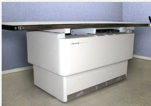
Elevating Table, 650 lb Patient Capacity