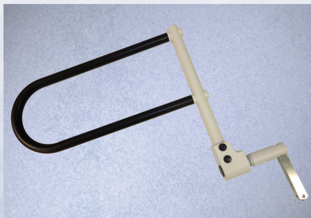
Overhead Grip for the J1000 Wallstand